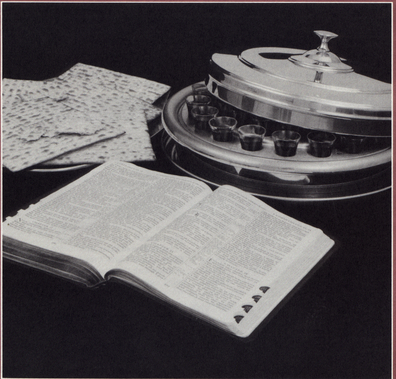
Christ's Final Passover