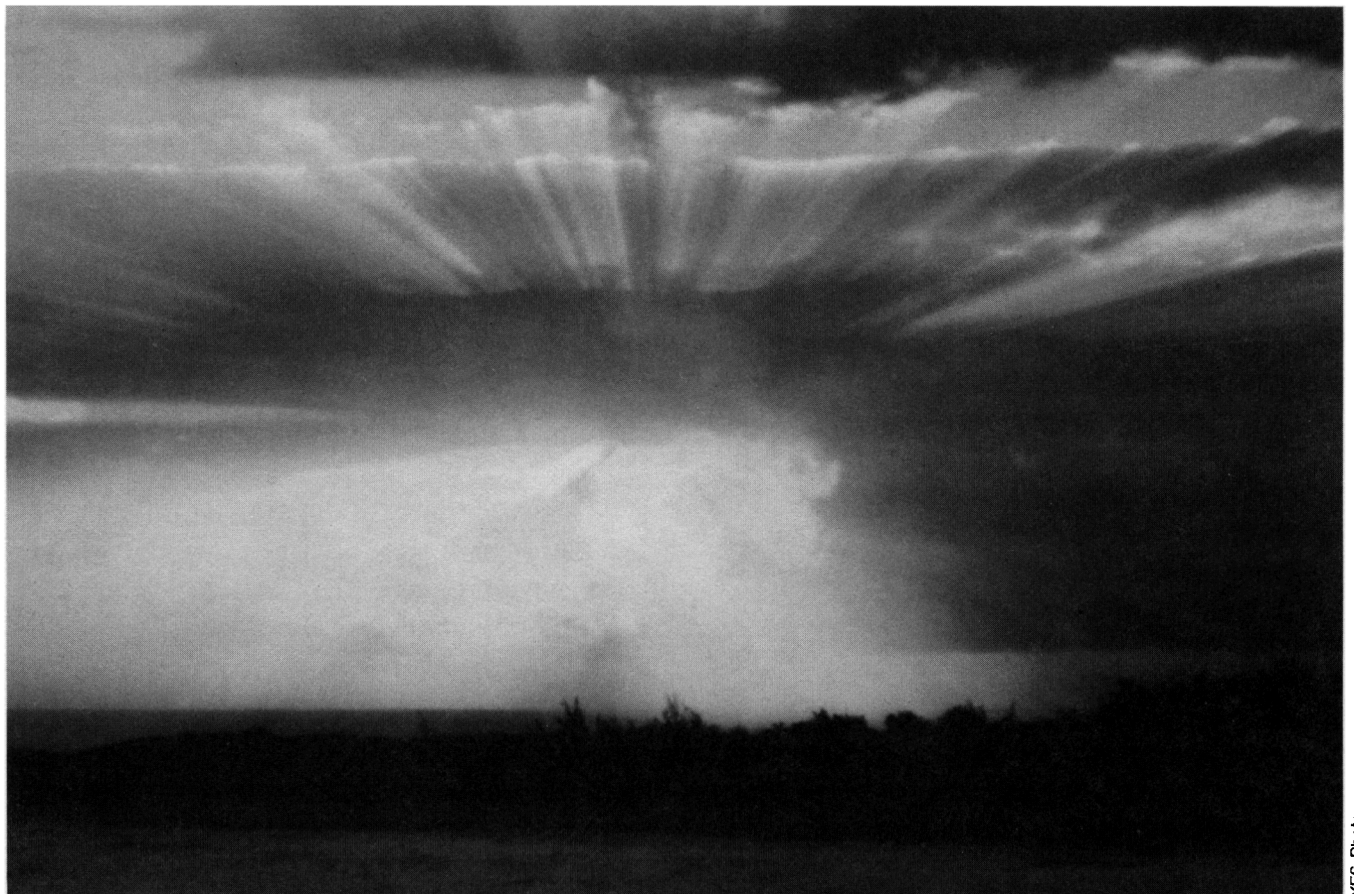
The Bible defines a day as being from sunset to sunset.

Jesus knew that the daylight portion of a day is equal to 12 hours. With three days of 12 hours and three nights of 12 hours, we have a total of 72 hours that Christ had to be in the tomb (John 11:9).